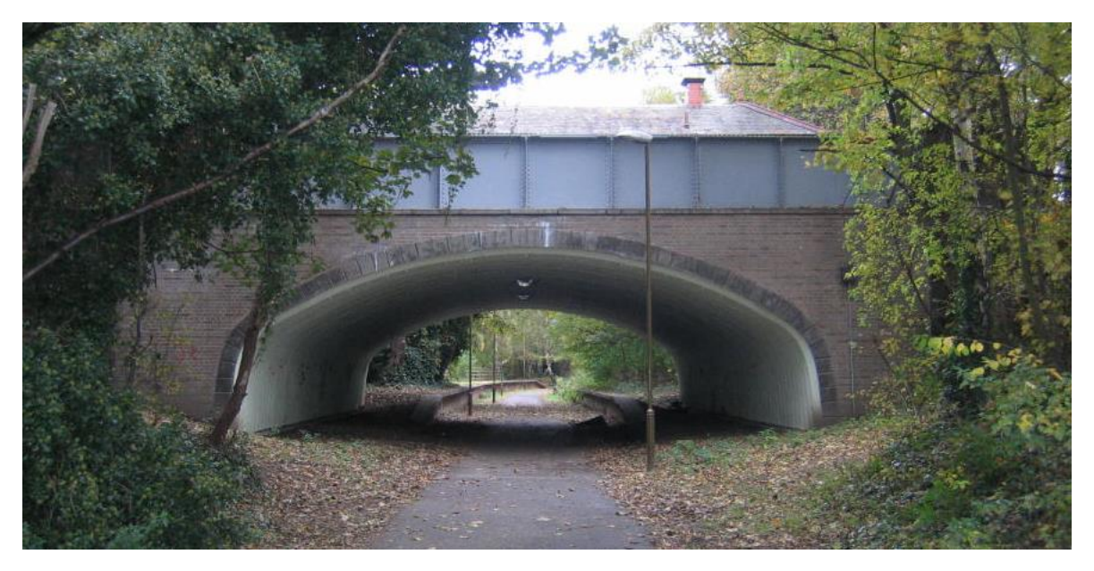
Figure 4 - Traquair Park East Bridge - Pinkhill