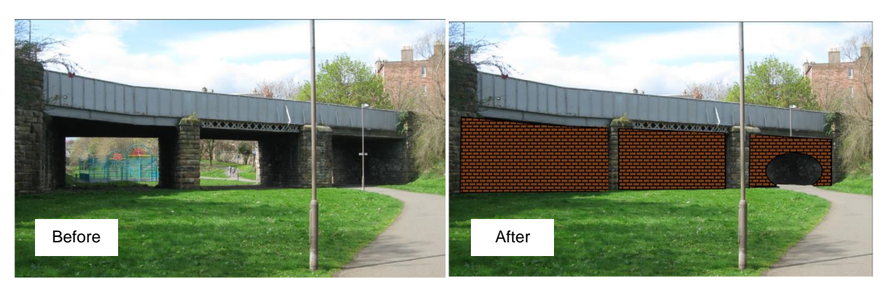
Figure 1 - Schematic of infilling solution