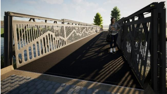
Figure 2 - Mabey Compact 200 steel modular bridge (Option 1)

4.18 The costs of a fibre reinforced plastic (FRP) bridge were also explored and were found to be on par with the modular steel solution. If Option 1 is progressed, further work would be done to determine the most suitable material for the replacement deck.