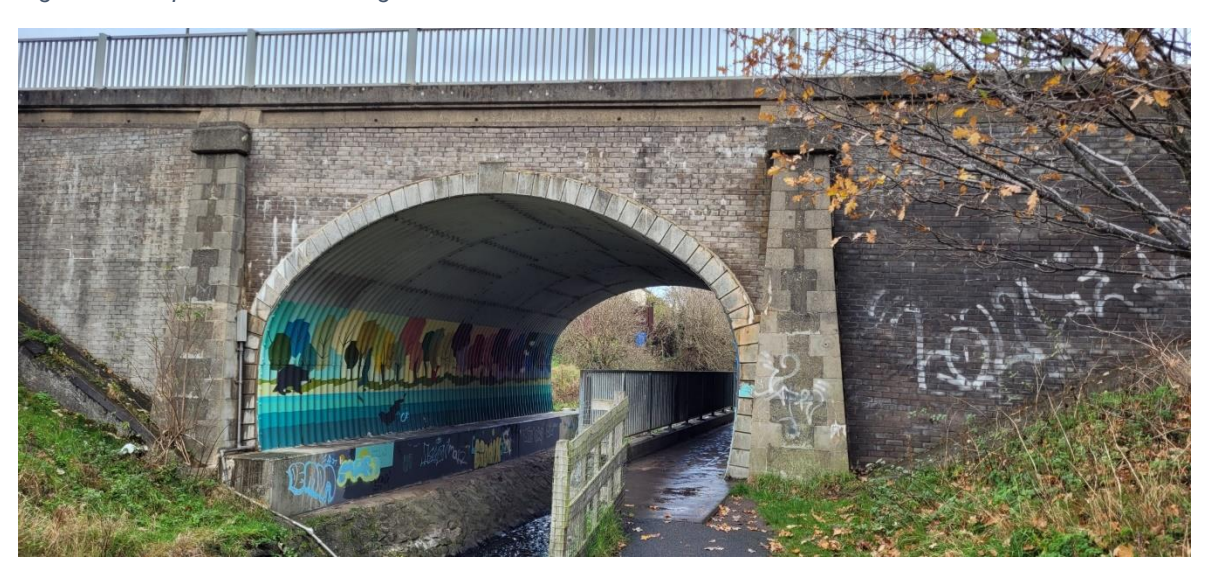
Figure 5 - Gilmerton Dykes Street (Hyvots Bank) Bridge