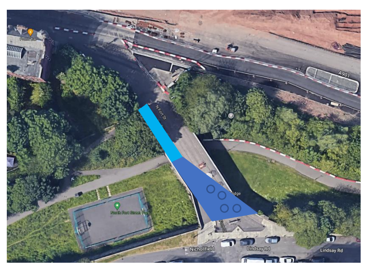
Figure 3 - Splayed bridge (Option 2)

4.21 Figure 3 indicates one possible layout but additional deck configurations would be explored during design. The construction of an extended abutment/embankment (following removal of the existing deck) under span 3 would also be explored to reduce costs.